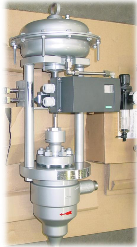
steam power plant